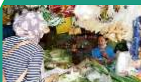
Data gathering with vegetable vendors in North Cotabato