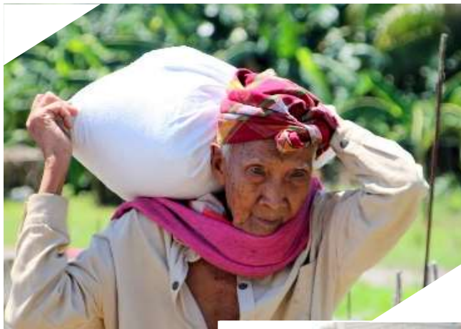
An elderly in PIKIT, NORTH COTABATO is among the individuals and vulnerable sectors affected by conflict in July 2020, who received food pack facilitated by BDA Inc.

was mobilized by BARMM to distribute rice packages in some areas in Sultan Kudarat and Tacurong City. The Food Survey Project also included areas in North Cotabato in gathering data on food supply chain. Likewise for its humanitarian response, BDA Inc. reached out to families affected by local armed conflict in Bulod and families affected by heavy flood in Inu-ug, all in Pikit, North Cotabato. Families in selected barangays of Mlang, North Cotabato and Isulan, Sultan Kudarat received meat packs from the Qurban Program facilitated by BDA Inc. Orphans from provinces of South and North Cotabato, Davao Oriental, Zamboanga del Norte and Sur, and cities of Mati, General Santos, and Pagadian City also received continuing assistance from Orphanage Program.