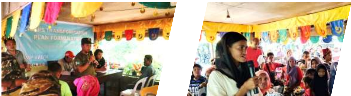
IN PHOTO: Field visits and community consultations in relation to the camps transformation planning in February 2020.

BDA Inc. shared its acquired knowledge and skills on planning (rural and urban planning), land use, geographical information system, administrative and financial management, others.