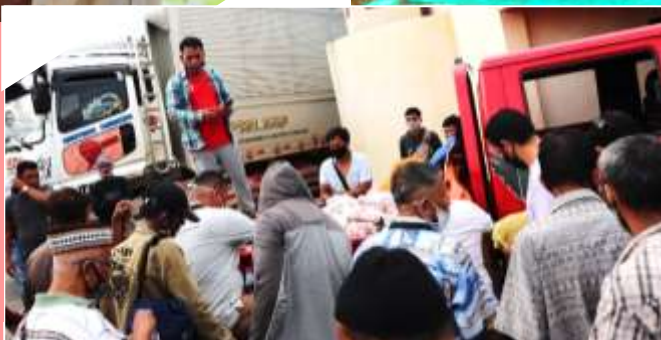
Unloading of meat packs during the Qurban 2020 in ISULAN, SULTAN KUDARAT PROVINCE