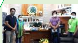
Courtesy Call to MILG-BARMM