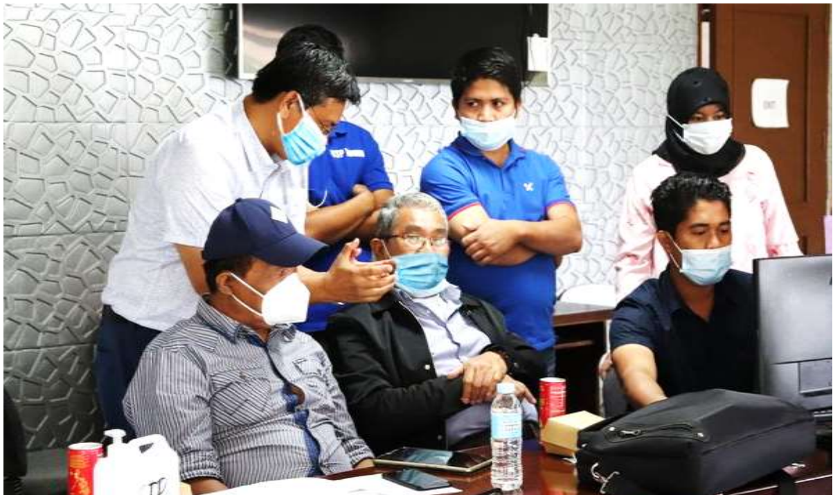
IN PHOTO: BDA Inc. executive director and the project team for the camps transformation planning providing assistance to the members of Camp Level JTFC-T MILF during a workshop in BDPA-BARMM, Bangsamoro Regional Complex in Cotabato City in July 2020.

With its experience and learning on community development, formulation of Bangsamoro Development Plan (BDP) in 2014, and with the implementation of development projects in camp communities, BDA Inc. was tasked to provide support to the camps transformation planning led by the Bangsamoro Planning and Development Authority (BPDA- BARMM). Personnel and official from the agency worked with the BPDA, Center for Humanitarian Dialogue (CHD), GPH- MILF Joint Task Forces on Camps Transformation (JTFC-T) and Camp Level TFCT and the Office of the Presidential Adviser on the Peace Process (OPAPP) from field visits, coordination to stakeholders, data gathering, series of workshop meetings, up to writing, planning and finalization of the Camps Transformation Plan.