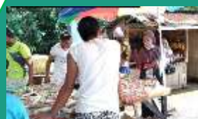
Data gathering with fish vendors in Island provinces

“Farm inputs are expensive, farm produce sells low. Agri facilities are rare, resulting to poor quality of products. Some communities are flood prone, leaving the crops swamped in water.”