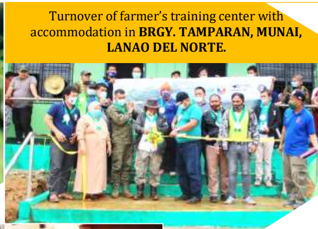
Turnover of farmer's training center with accommodation in BRGY. TAMPARAN, MUNAI, LANA DEL NORTE.