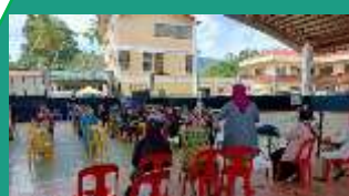
Focus-group discussion in Lanao Sur