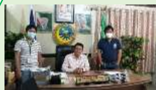
Courtesy Call with MAFAR-BARMM