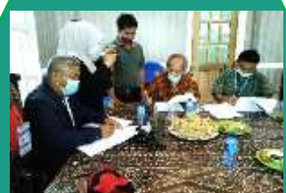
Signing of MOU with LGU