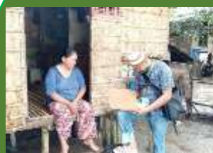
House-to-house data gathering