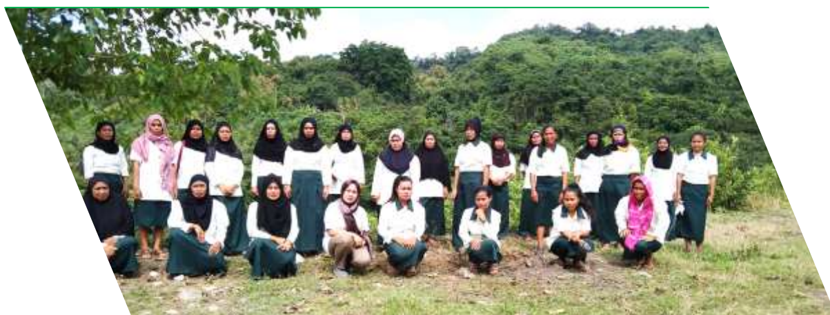
IN PHOTO: Completers of skills training in December 2020 under the Phase III of MTF-RDP. They are among the 295 first batch of beneficiaries of this project component, who learned knowledge and skills on dress making that they may used to have or supplement incomes- making them productive member of their community.

Skills and productivity trainings were among the sub-components of the MTF-RDP/3. For skills training, the first batch was completed in December 2020 with 295 beneficiaries. These were the completers of ALS from previous phase of MTF-RDP, who were provided with trainings that fit their interest and capacity that they may use to become productive. For instance, beneficiaries in Camp Badre completed a dressmaking course from which they can produce and sell locally made ready-to-wear items.